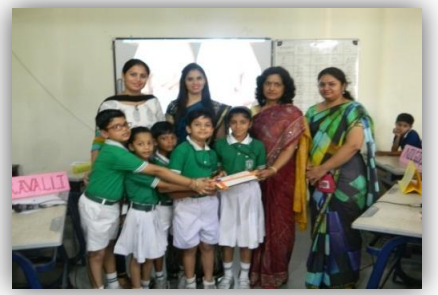
Quiz Competition of class – III was organized on 24<sup>th</sup> Sept.' 15.<mark>Shivalik House</mark> got 1<sup>st</sup> position followed by Aravali House.