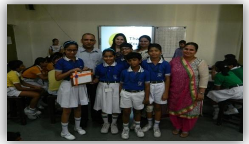
Quiz Competition of class - V was organized on 22<sup>nd</sup> Sept.' 15. Nilgiri House got 1<sup>st</sup> position followed by Vindhyachal House.