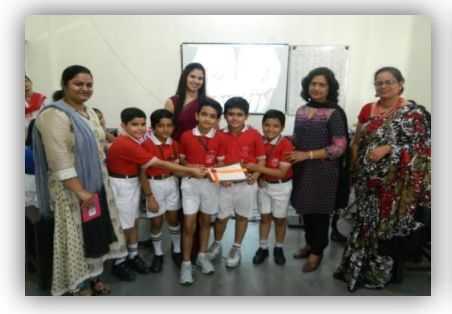
Quiz Competition of class – IV was organized on 23<sup>rd</sup> Sept.' 15. Aravalli House got 1<sup>st</sup> position.